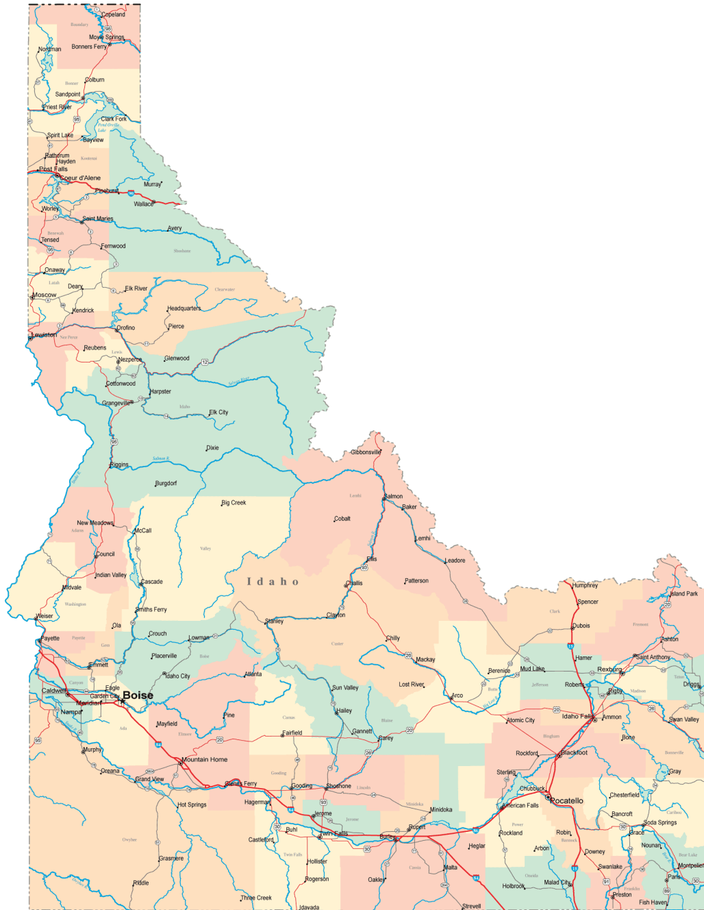
Map 1 Idaho Roadways

In Idaho, the percentage of 15-18 year old licensed drivers compared to the total driving population has been steadily declining since 1997. There are 16,000 fewer teen drivers in 2010 then there were in 1997. See Chart 3. According to the U.S. Census, the population of the 15-19 age range was 110,124 in 1997. The population of 15-19 year olds increased to 116,117 in 2011.